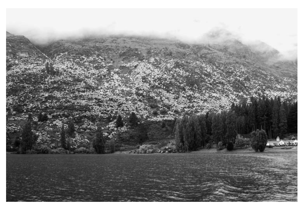
PLATE 1. Invasion of scotch broom ( Cytisus scoparius ; lighter color on slope) on the western coast of the South Island of New Zealand in 2004. Patterns of invasion and dominance within small patches may be unrelated to such patterns at the scale of the hillside.